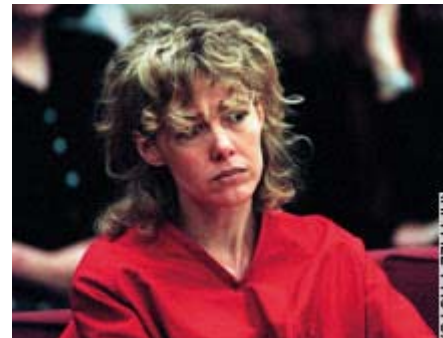
Mary Kay Letourneau

GIG HARBOR, Washington (AP) - Mary Kay Letourneau, the grade school teacher convicted in 1997 for having sex with a sixth-grade pupil, was released from prison early Wednesday, and her now 21-year-old former lover plans to challenge a court order that bars her from contacting him, a friend said.